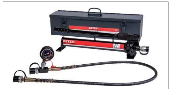
Handpumpset PB 700