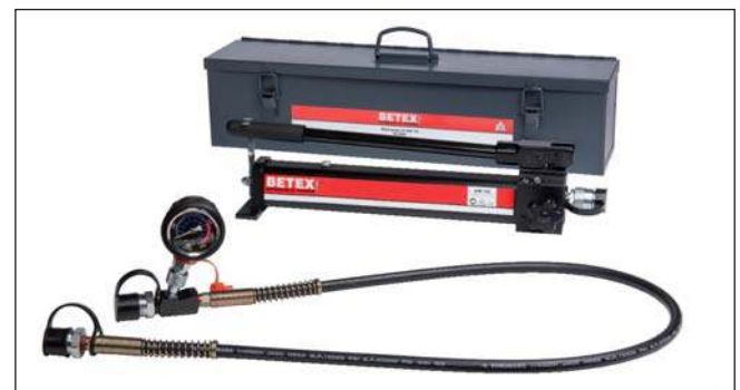
Handpumpset AHP 702